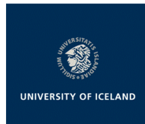
University of Iceland