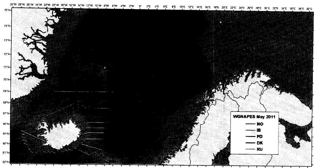
Preliminary survey tracks for the 2012 International surveys in the Nordic Seas.